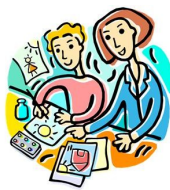
Social Worker (SW)