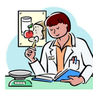
Registered Dietician (RD)