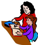
Certified Diabetes Educator (CDE)