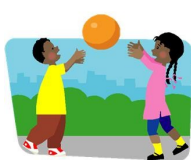
Physical Therapy (PT)